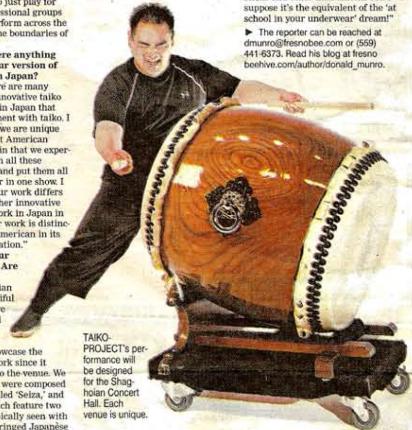
TAIKOPROJECT's performance will be designed for the Shaghoian Concert Hall. Each venue is unique.